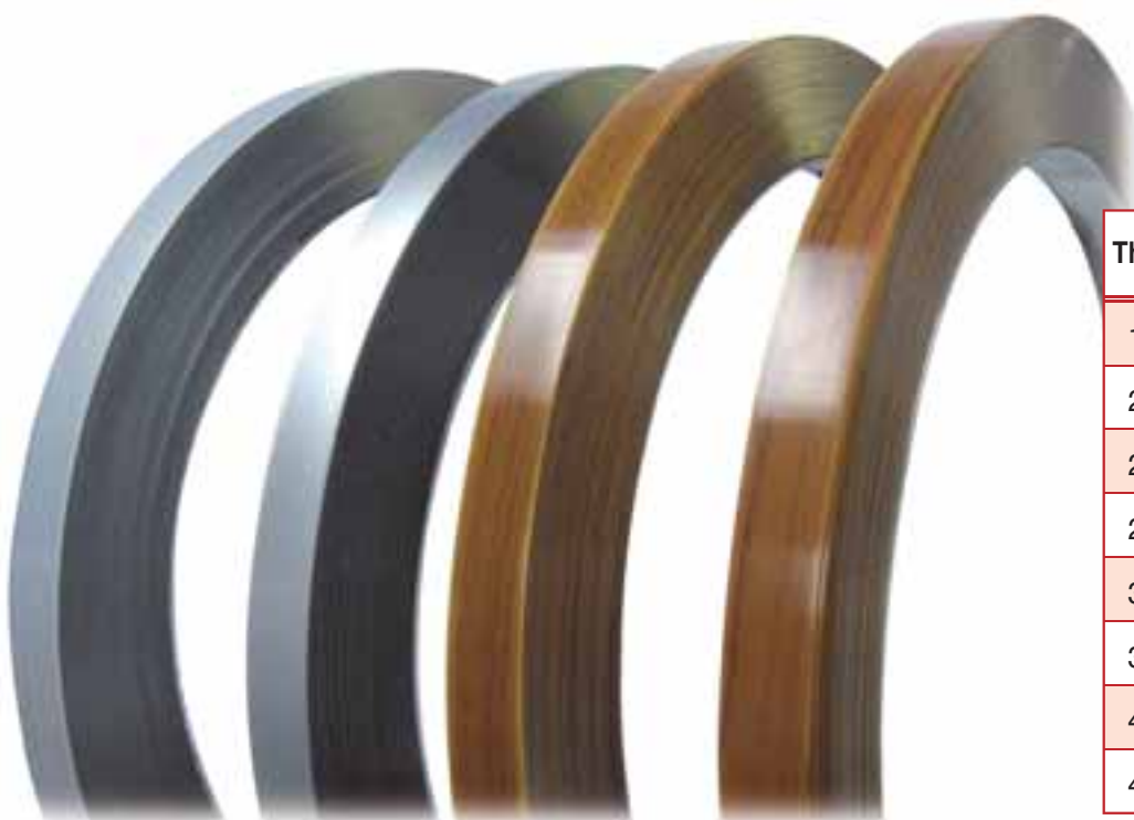
Edging Size Available

■ 3D Transparent Edging is the outcome of Scanwolf's continuous pursuance in product innovation. Its impressive brilliance, unique spatial depth effect and stunning finish are all evidence of its prime quality. Classic 3D Transparent Edgings are extruded with smooth surfaces. However, a wide range of embossed ripple surfaces or textures are also available for individual preference. When used as a matching edge, 3D Transparent Edging joins surface to edge seamlessly. And as a contrasting edge, it assigns a distinctive character to furniture pieces, elevating their value and classiness.