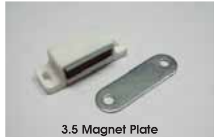
3.5 Magnet Plate