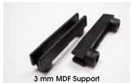
3 mm MDF Support