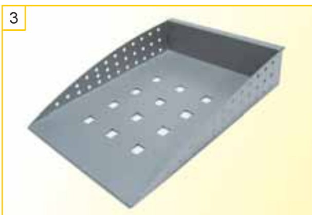
Item : TR 135 Document Tray