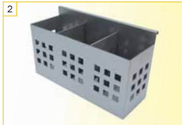
Item : TR 134 Pen Holder