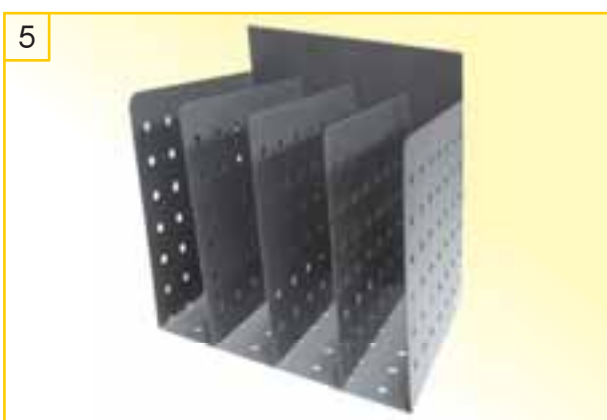
Item : TR 137 Document Shelf