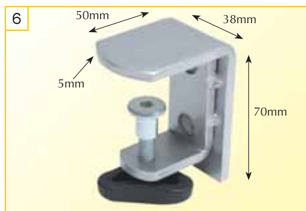
Item : TR113 Workstation Divider Bracket