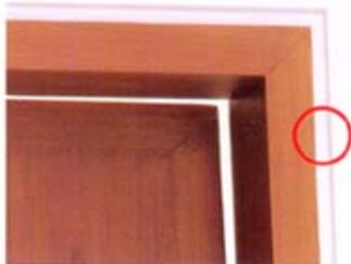
DW2 DOOR / WINDOW JAMB PROFILE 5MM X 18MM DWP1.B01.1