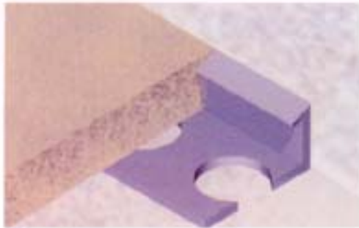
MJ1 FLOOR/WALL EXPANSION MOVEMENT JOINT, PERIMETER EXJI.B01.1

With the usage of Movement joints, surface cracking and debonding of tiles from screed may can be prevented.