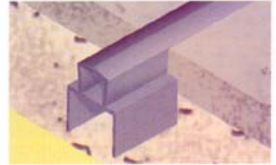
MJ3 FLOOR TOPPING GUIDE FTG1.A01