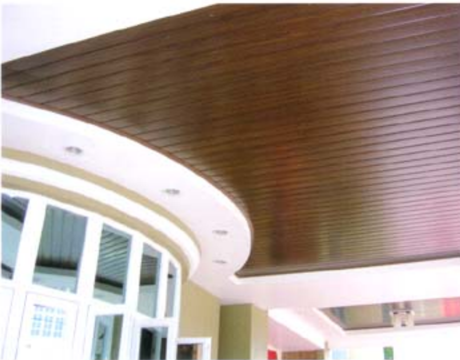
CP1 F1133 CEILING PROFILE 8ft/pcs / 12ft/pcs