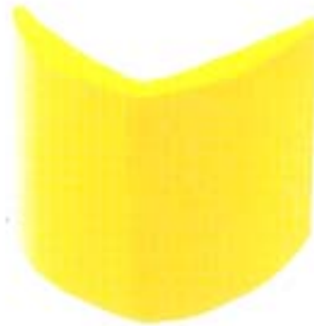
PG1 PARKING GUARD / POST PROTECTOR FIT2.A019.31

The Parking Guard or Post Protector by Scanwolf is specifically designed to fit over the edges of pillars in high car traffic locations such as parking lots. The Parking Guards are useful in protecting columns or pillar edges from chips and cracks resulting from collision. It is also available in bright colours, to help motorists who park in indoor car parks to better gauge the distance between their vehicles and the pillars, reducing collisions.