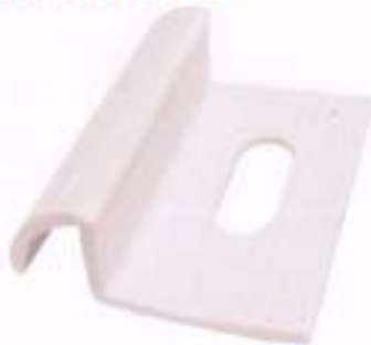
TP1 TILE TRIM CORNER TIL1.A01.0018

With the Trimmings Profile, rugged and sharp tile edges can be avoided. Tile setters will be able to do away with the time consuming - mitering of tile edges.